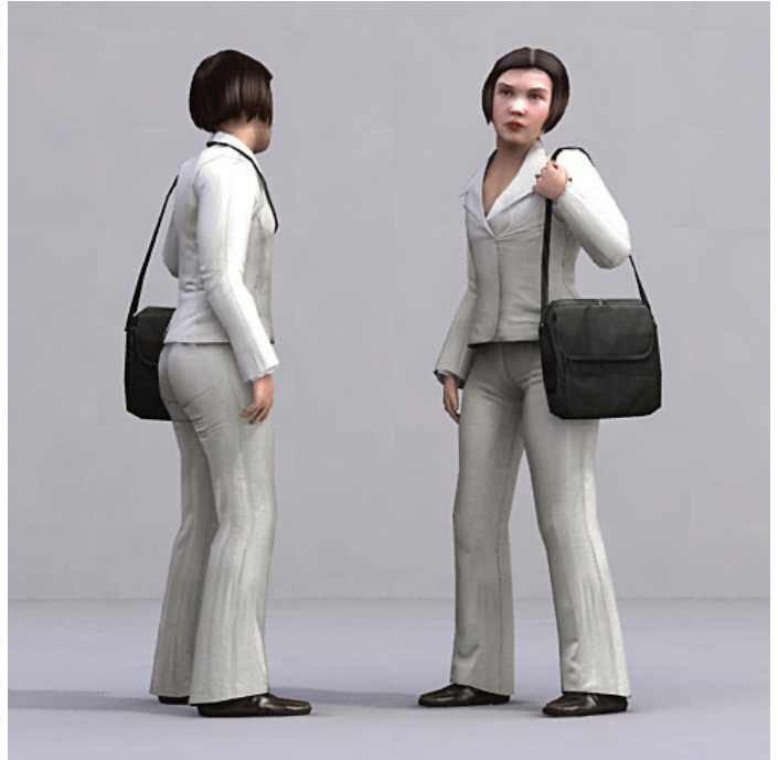
BWomOOII-M2 BUSINESS WOMAN