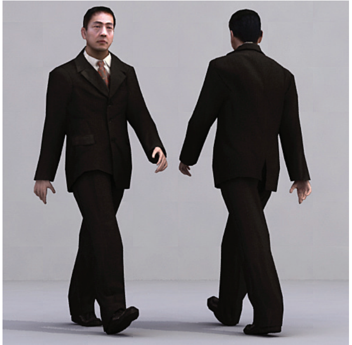
BMan00 | 2-M2 BUSINESS MAN