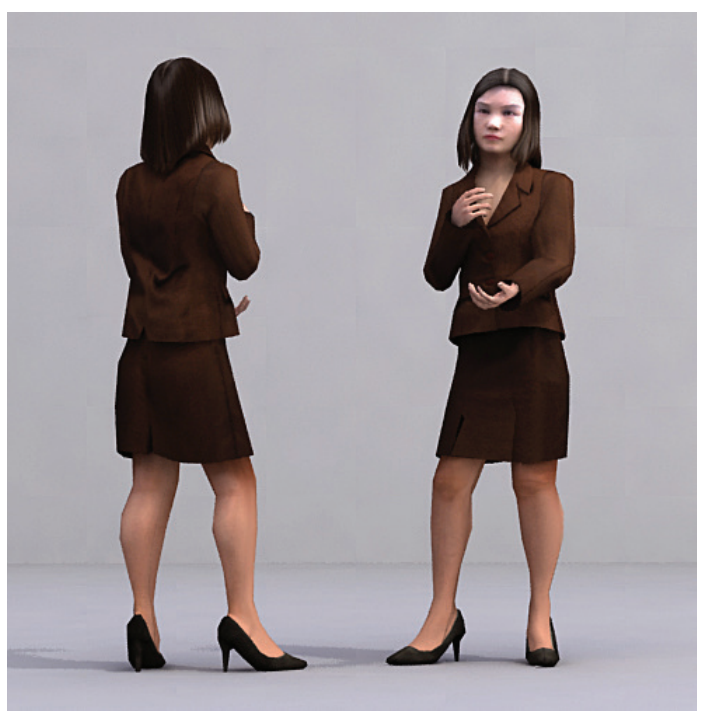
BWomOO I 2-M2 BUSINESS WOMAN