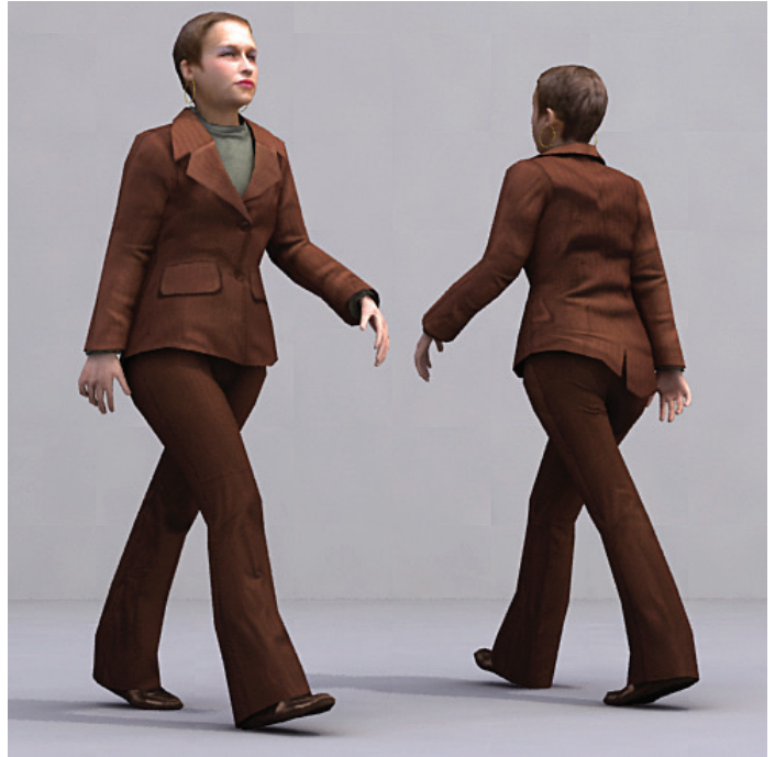
BWomOO I 3-M2 BUSINESS WOMAN