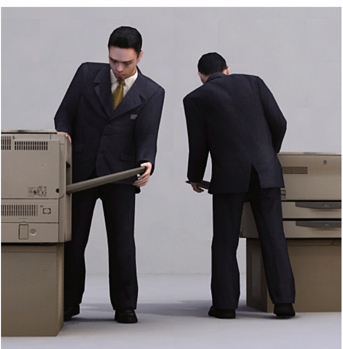
BMan0013-M2 BUSINESS MAN