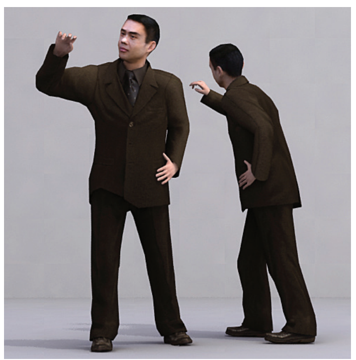
BMan0011-M2 BUSINESS MAN