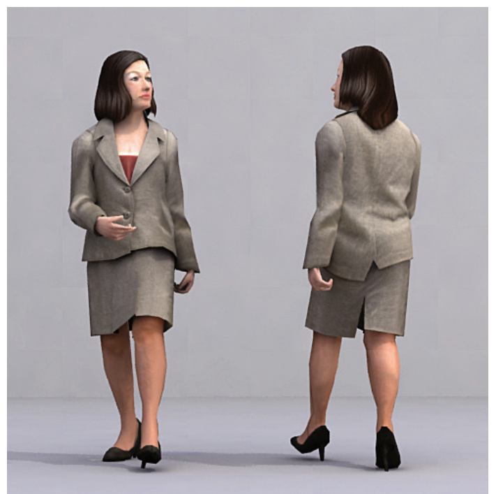
BWomOO I 4-M2 BUSINESS WOMAN