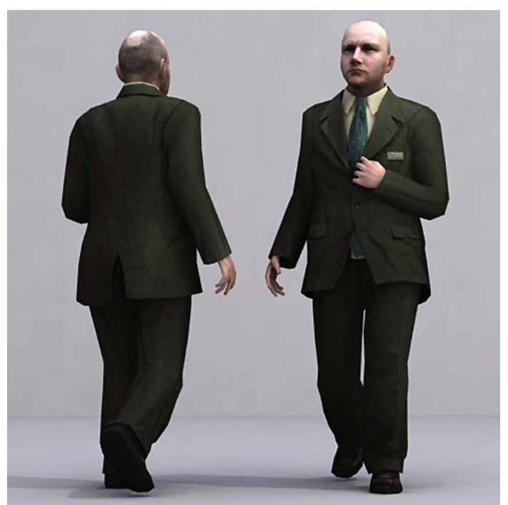
BMan0015-M2 BUSINESS MAN