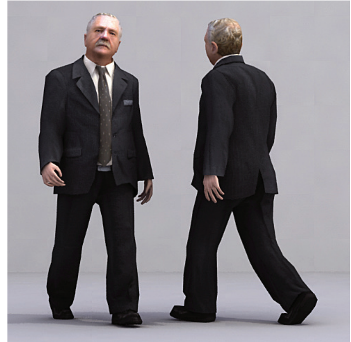
BMan00 I 4-M2 BUSINESS MAN