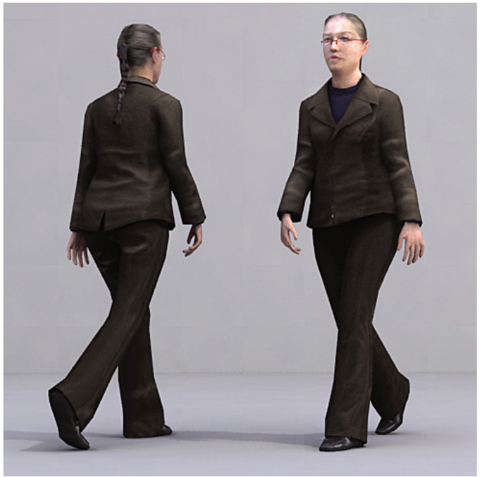
BWomOO I 5-M2 BUSINESS WOMAN