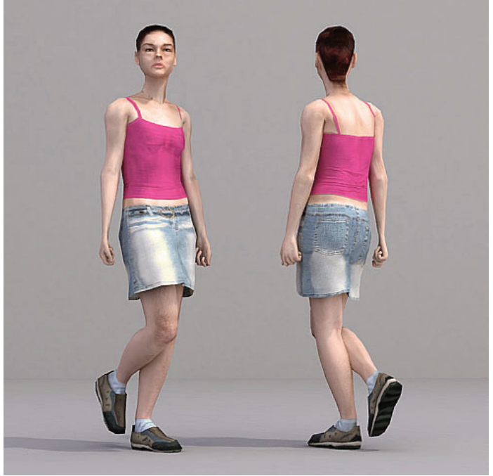
CWomOO I 8-M2 CASUAL WOMAN