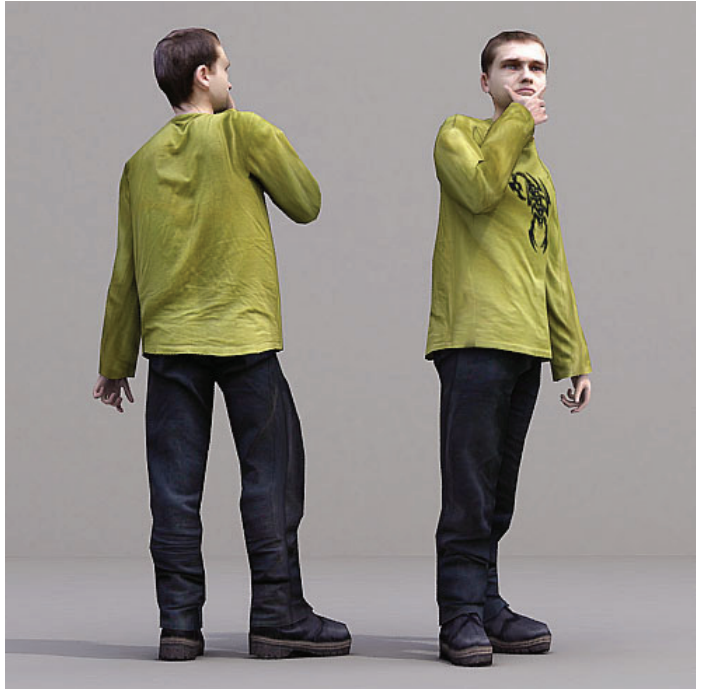
CManOO I 9-M2 CASUAL MAN