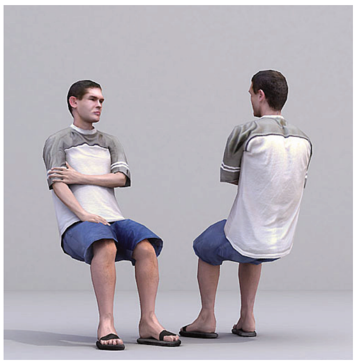
CManOO I 6-M2