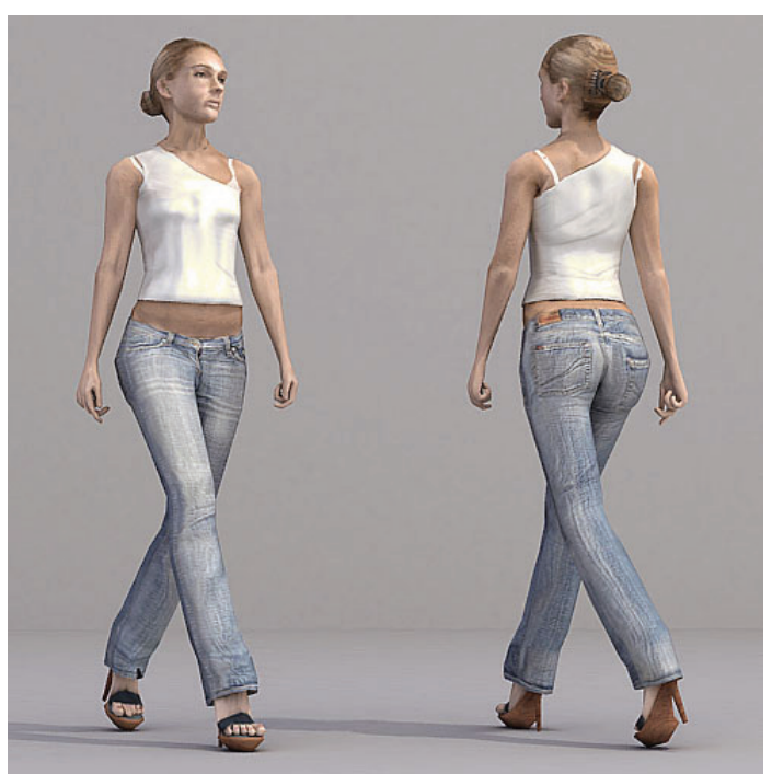
CWomOO I 9-M2 CASUAL WOMAN