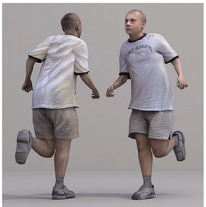
CMan0020-M2 CASUAL MAN