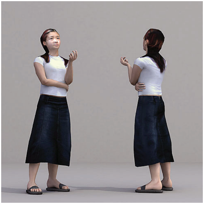
CWom0022-M2 CASUAL WOMAN