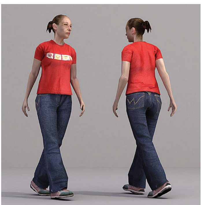
CWomOO2 I -M2 CASUAL WOMAN