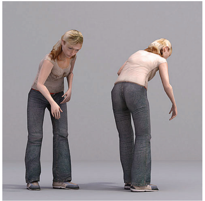
CWomOO2O-M2 CASUAL WOMAN