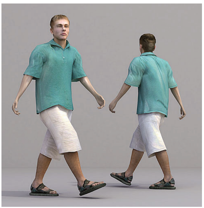
CManOO I 8-M2