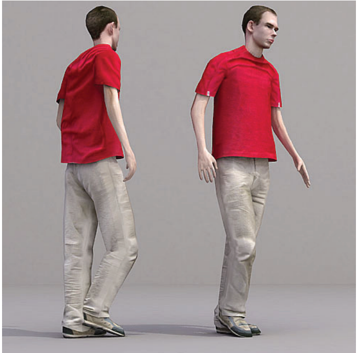
CManOO I 7-M2 CASUAL MAN